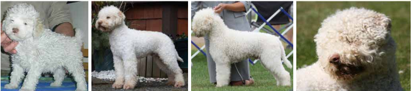
Pictures of a white Lagotto from 8 weeks to 2 years of age showing coat development.

With regards to movement, this is a working dog and their movement should be happy and lively. It is important that each stride is effortless and covering a lot of ground to make their work easier on them. This is where the structure of the dog is important as how they are built will determine how they will move. Lagotto should have a lot of reach with their front legs and drive from their rear legs and they should move straight.